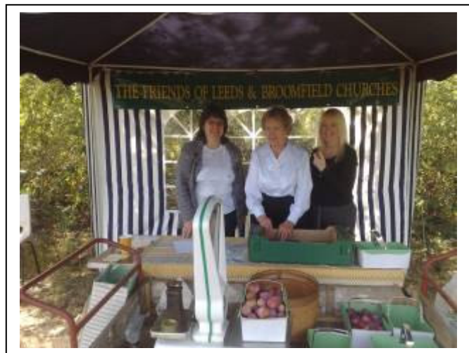
Plum Picking August 2009