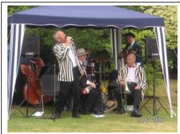
The Chicago Jazzmen