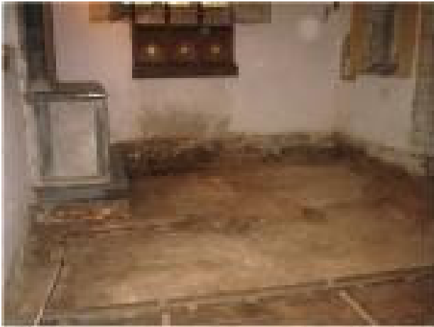
The Lady Chapel floor at Leeds church in need of repair

When you pass by the two Parish Churches you might well think that they are solid, durable, well preserved parts of our precious village landscapes. The appearance is deceptive.