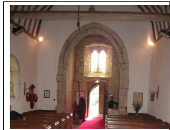
Keeping our churches beautiful inside and out