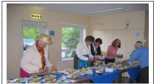
Race Night preparations – scrumptious food....