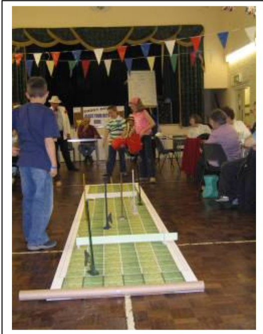
A view of work needed at Leeds church