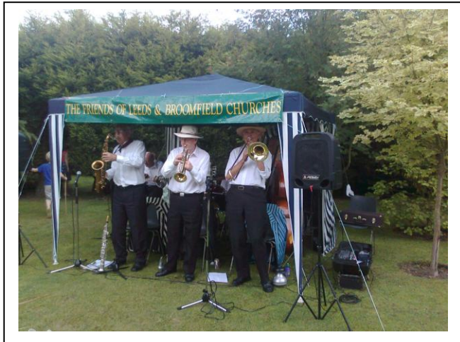
The Chicago Jazzmen in full swing

On July 10 th we packed a picnic and wended our way down the road to our neighbours, June and Jonathan Harrison, for Jazz in the Garden. It was a glorious day and as we approached we could hear the babble of voices and smell the mouth-watering scent of sausages being cooked on a barbecue.